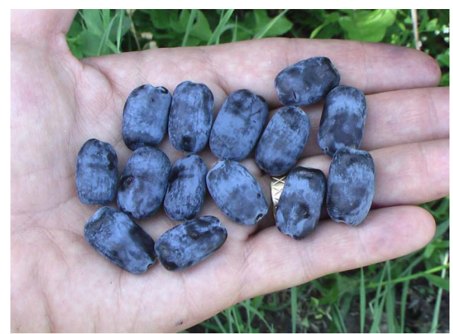
Figure 2. 'Tundra' is a new U of S cultivar recommended for fruit growers.