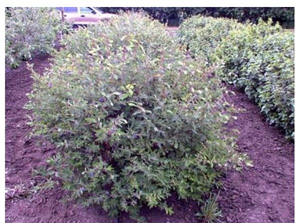
Figure 4. Haskap bushes are well behaved. They don't sucker and have a nice rounded shape. When Haskap get older they need to be thinned.