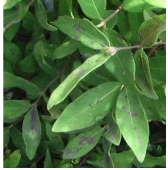
Figure 7. Mildew on a susceptible cultivar. So far the U of S has been highly resistant to powdery mildew but many varieties get it in mid July. This disease may not matter much to the farmer but could be rather ugly in your yard.

Diseases: The only diseases we have seen is powdery mildew which starts in the heat of July, well after harvest. Susceptibility varies tremendously between varieties. Some varieties are severely affected while others appear immune. Our new selections are very resistant except for 9-15. (9-15 had twice the yield and may have been particularly stressed that year from the heavy fruit load).