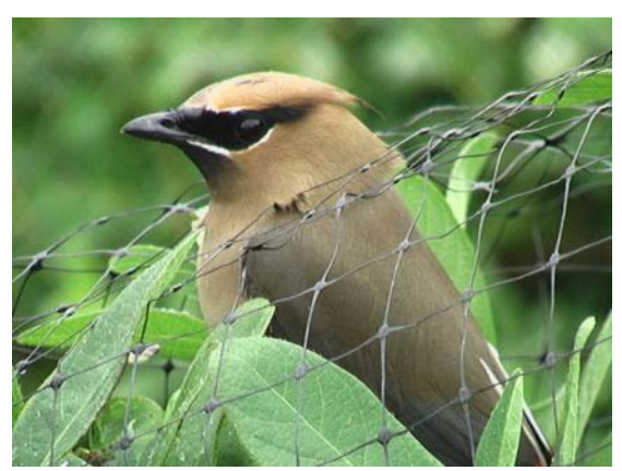
Figure 6. Help me!!!

Birds, particularly Cedar Waxwings, love Haskap. For 3 years they ignored our berries but then they wiped out 2 years of crops before we bought bird netting. I recommend using a ½ inch netting. If you buy the cheaper 1 inch you will have birds stuck with their heads in the net. It's pretty gross especially when they are dead. Waxwings will 'freeze' when trapped and it is fairly easy to remove them. They don't try to attack you. A grower suggested buying a type of bailing netting for round straw bales. I was told this may be 1/4<sup>th</sup> the price of