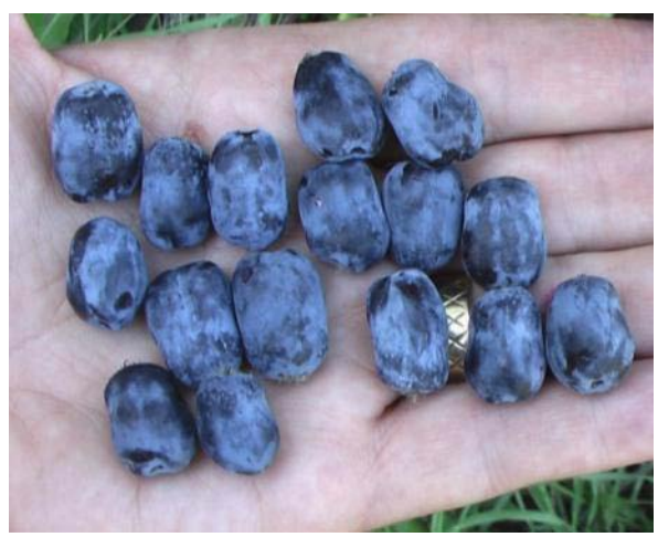
Figure 1. 'Borealis' is a new cultivar recommended for home gardeners.