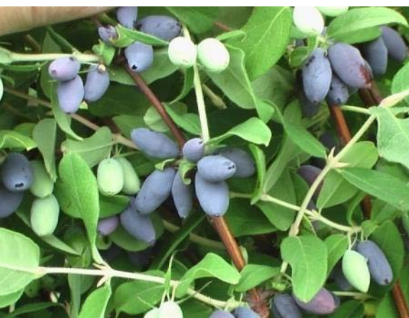
Figure 3. A Russian variety beginning to ripen. Wait for all berries turn blue on the outside. The inside will be purple (not green) when fully ripe.

Horrible tasting, ornamental versions of this plant were bred in the 1950's at a research station in Beaverlodge, AB which probably caused fruit breeders in North America to be completely disinterested in this plant.